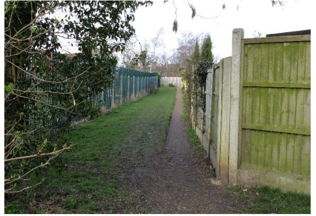
Left turn after playing field.