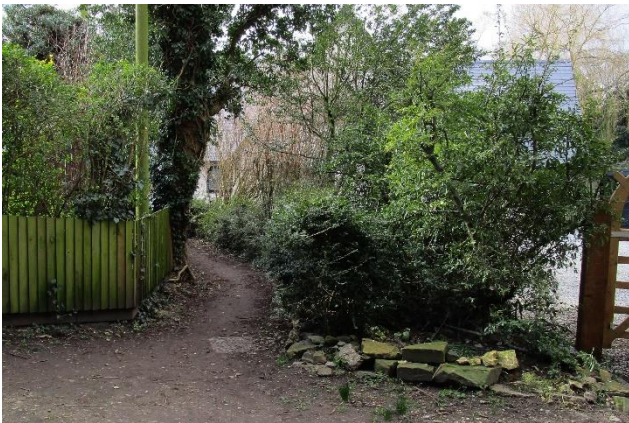
Turn right on path after no. 32