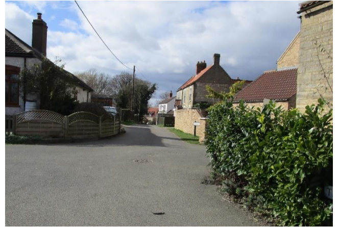
Continue to Church Lane