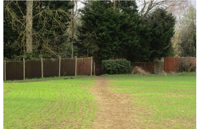
Footpath across to yellow marker, turn right.