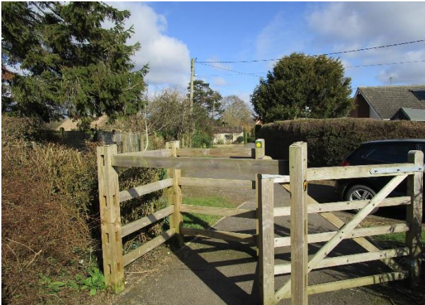
Kissing Gate, carry straight forward