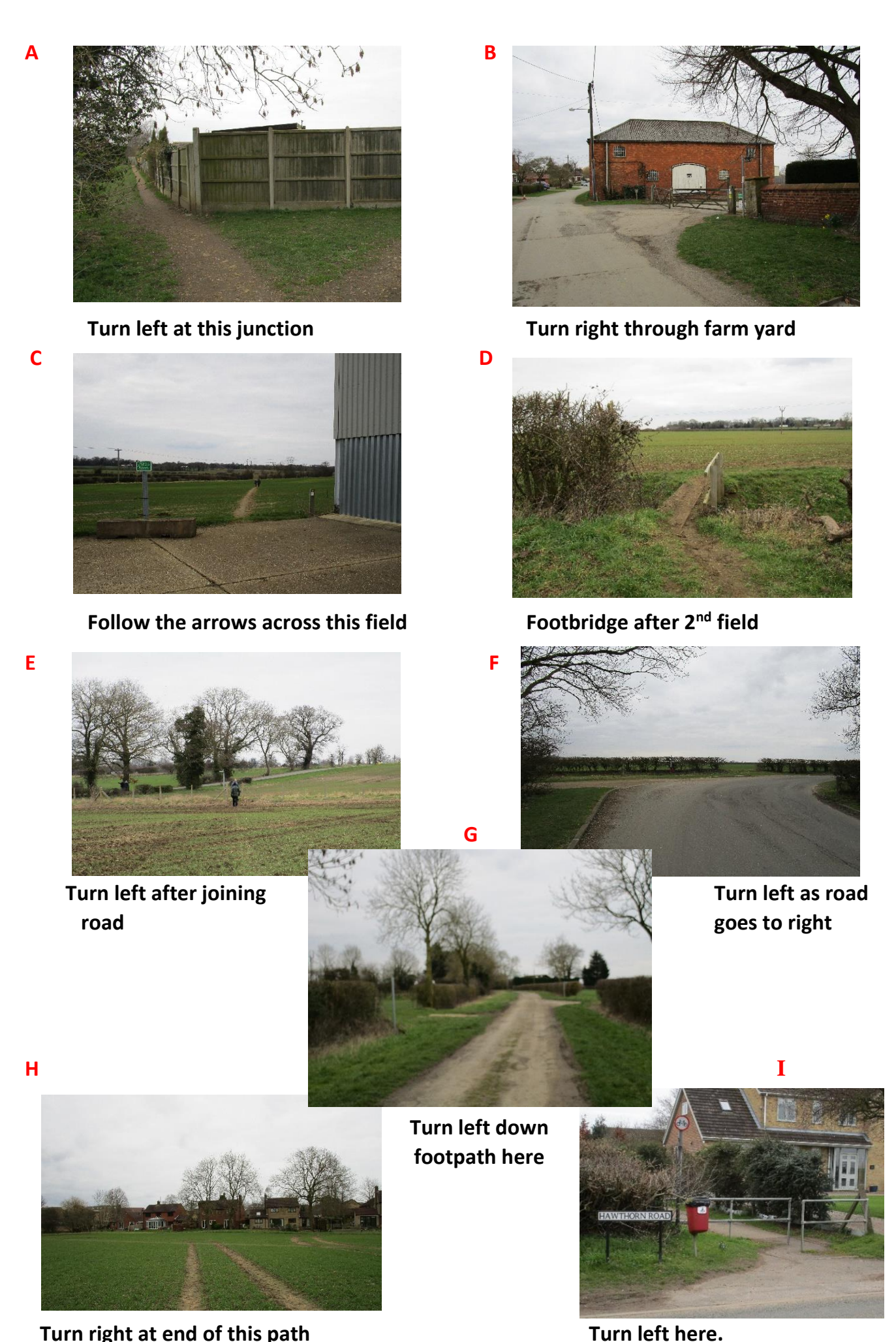
Turn right at end of this path