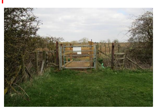
2<sup>nd</sup> Field gate