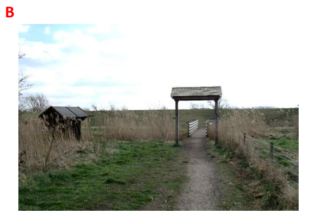
Footbridge to riverbank, turn right.