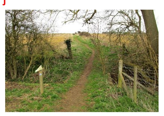
Continue uphill to track at top.

Field gate on opposite site of farm track.