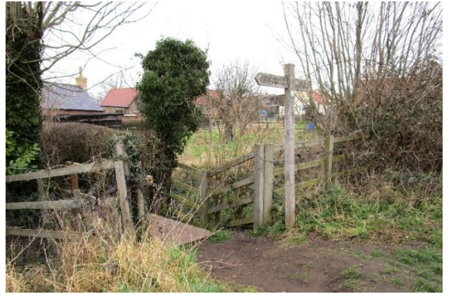
Turn left over this small footbridge.