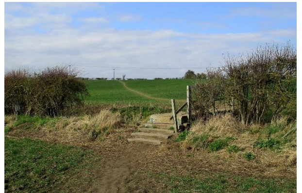
Footbridge at end of first field.