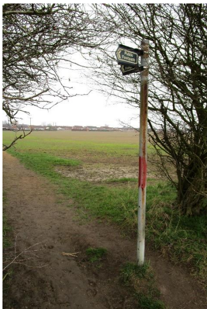
Turn left here towards Lady Meers Road